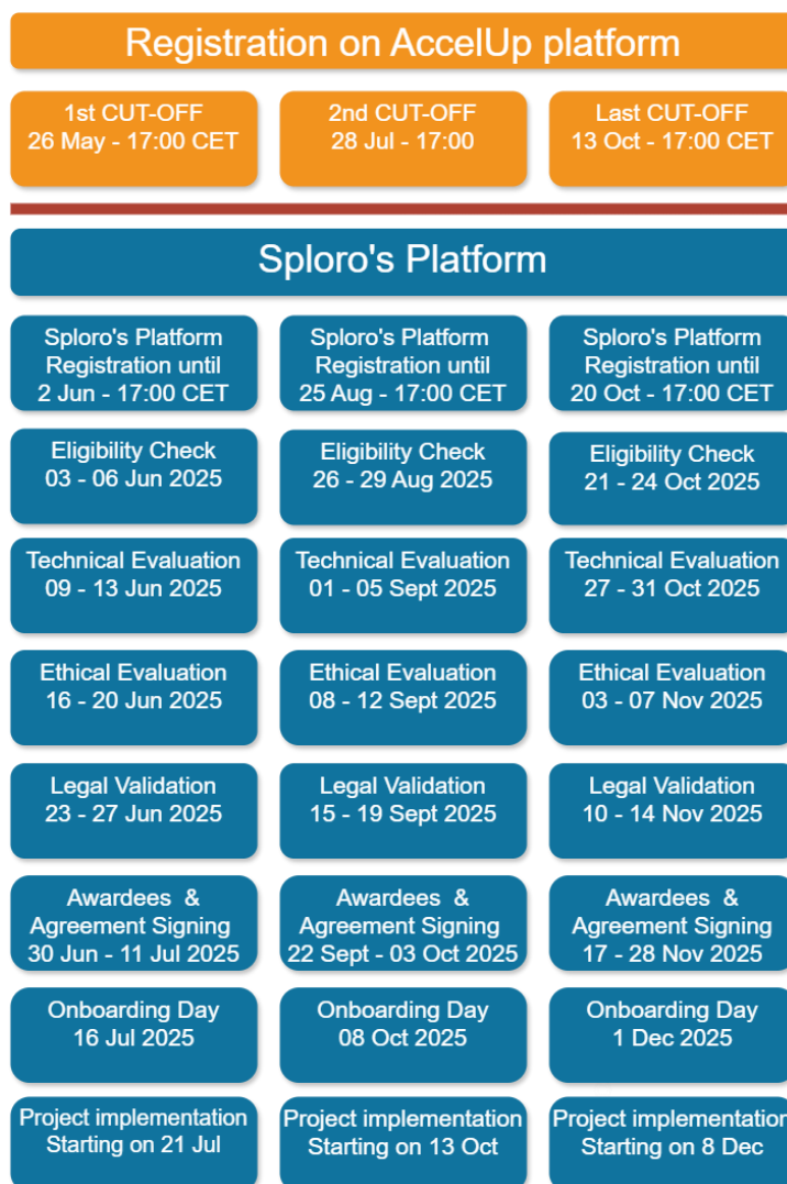
Figure 1. Open Call CUT-OFF Periods

1. Registration on the AccelUP Platform: Starting with 3 rd of March 2025 for both Innovators and Living Labs.