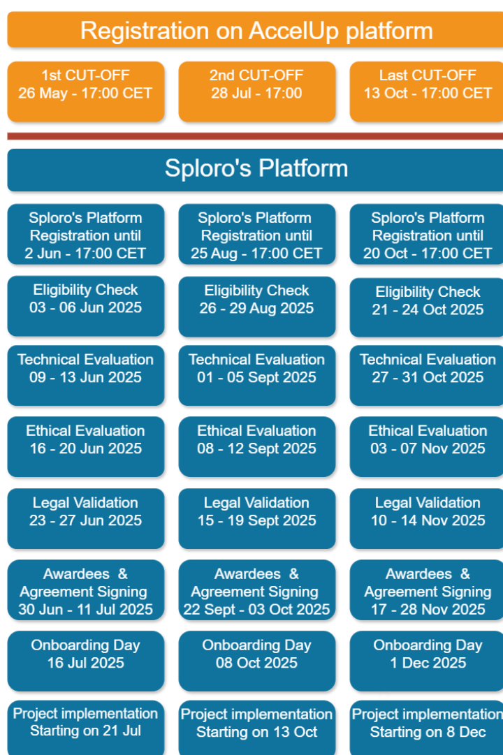
Figure 1. Open Call CUT-OFF Periods